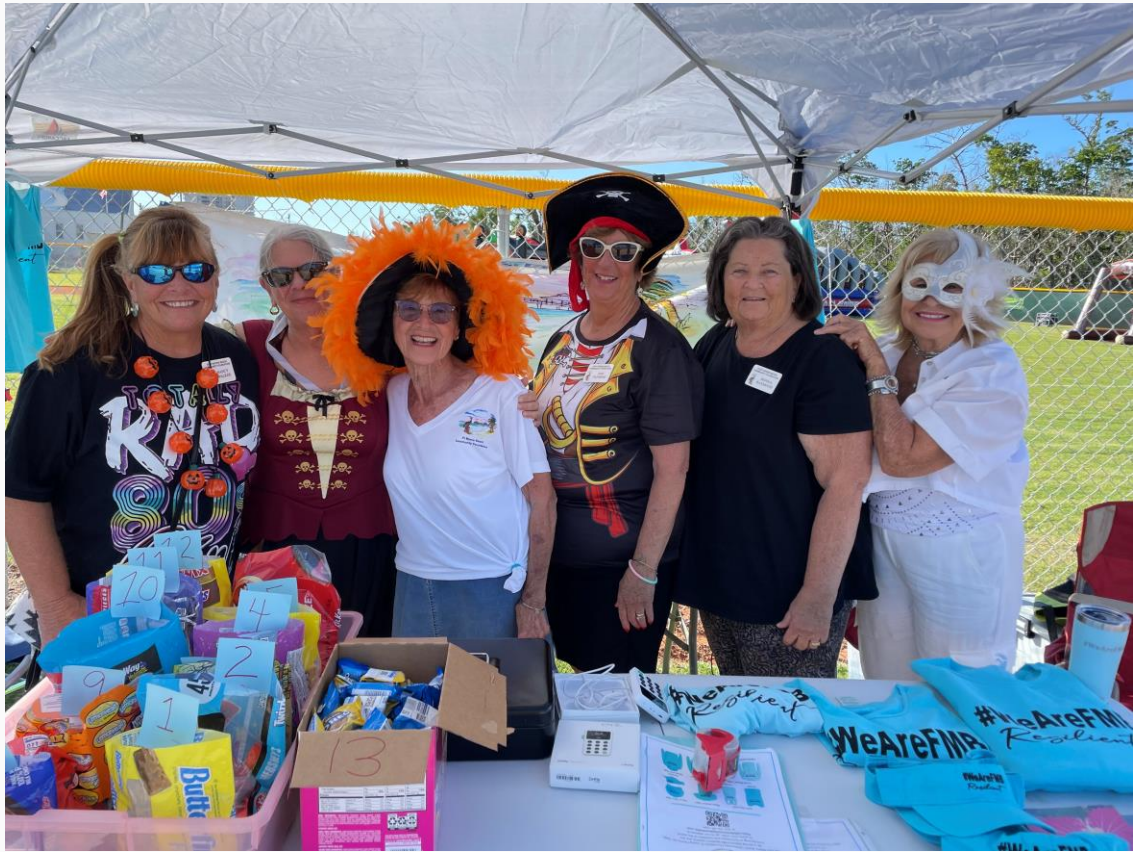
Fright Night at Bay Oaks. Not looking too scary!